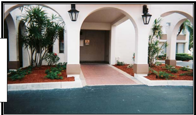
CASA BONITA I ENTRANCE · RIGHT SIDE NEW BUSHES · NEW FLOWERS NO ROCKS · NO PIPES