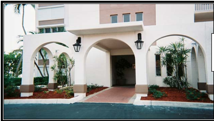
CASA BONITA I ENTRANCE · LEFT SIDE NEW LAND SCAPING