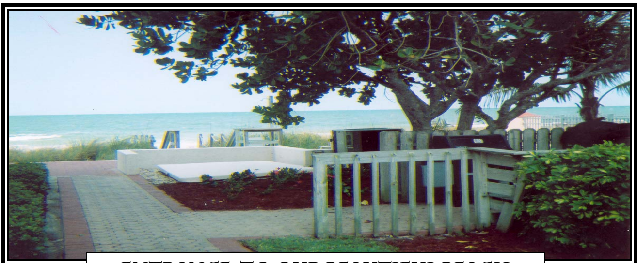
ENTRANCE TO OUR BEAUTIFUL BEACH NEW LANDSCAPING