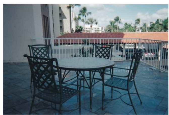
NEW DECK & FURNITURE