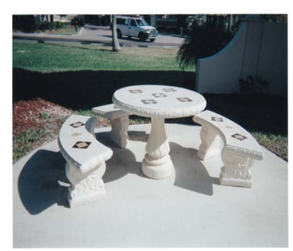
NEW SHUFFLEBOARD FURNITURE