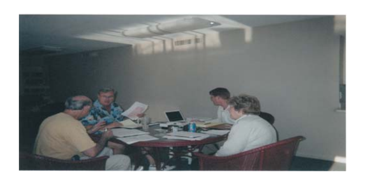
The CBI Board hard at work - FOR US!